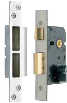
655 Mortice Lock Double Cylinder 57mm backset

Available in either 57mm or 45mm backsets.