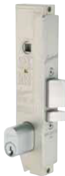
2500 Series Cylinder Mortice Combination Locking Latch