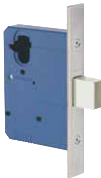
1700 Series Deadbolts for external doors (deadbolt)