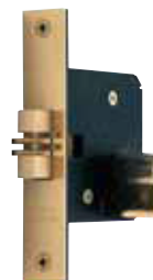
760 Sliding Door Mortice Lock Double Cylinder

** Insert finish code here when ordering.