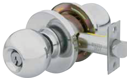
Key in knob lockset 4000 SS