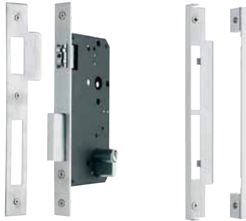
775 Roller Bolt Mortice Lock Double Cylinder 60mm backset 775 SC 60 775 SC 45

Features non-handed design for left or right-handed doors.