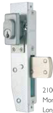
2100 Series Cylinder Mortice Deadlock Long Throw