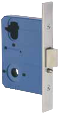
1900 Series# Nightlatch for duct or cupboard doors (deadlatching) Cylinder or tumbutton retracts latch No furniture