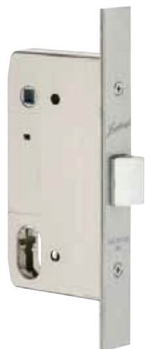
3600 Series Passage latch only

Handle/knob locked both sides by key/tumbbutton