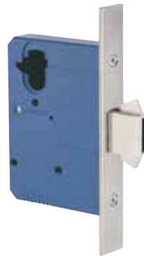
1800 Series Sliding door lock for external sliding doors (deadbolt)