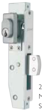
2000 Series Cylinder Mortice Deadlock Short Throw