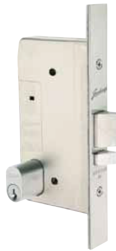
3900 Series Nightlatch (deadlatching)

Key or snib retraction of latchbolt No handle/knob furniture