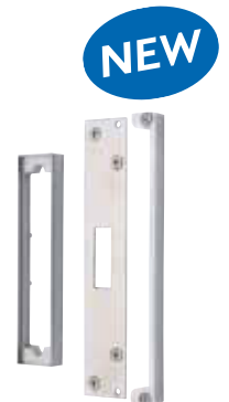
760 RK Rebate Kit to suit 760 Series Sliding Door Mortice Lock

(Specify 768 for Single Cylinder version)