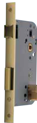
755 Mortice Lock Double Cylinder

For use in conjunction with a 760 series mortice lock on a rebated double door. Non-handed to suit left or right-handed doors. The 760 RK suits a minimum door thickness of 40mm.