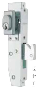
2200 Series Cylinder Mortice Sliding Door Deadlock