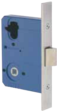
1100 Series# Passage latch for latch furniture (latching)