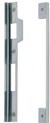
757 Rebate Kit to suit 755 Series Mortice Lock

Extended strike plate to suit pivot doors is available separately – PT755/SPEI SSS