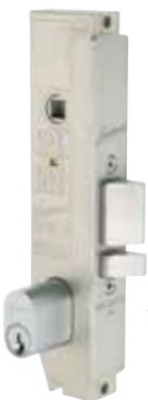
2400 Series Cylinder Mortice Vestibule Lock