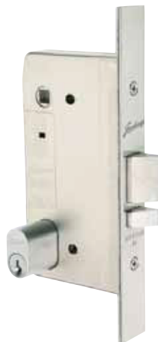
3400 Series Vestibule lock (deadlatching)

Handle/knob locked on one side only by key/ tumbbutton