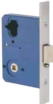
1400 Series# Vestibule lock – Single cylinders – Double cylinders – Single cylinders and tumbutton – Tumbutton one side – All have egress from inside at all times