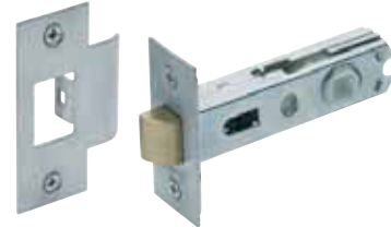
Rectangular face and universal strike 60mm backset 480T BC PB SC