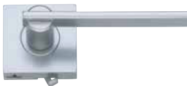
Privacy adaptor with Linear leverset 9909 CP SC

When ordering, add relevant finish code to form complete catalogue number, as shown under products illustrated.