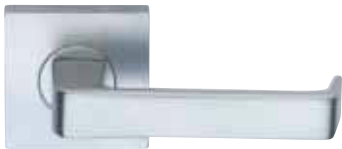
President lever on square backplate 9950 CP SC