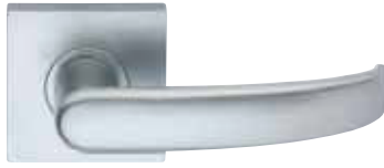
Radius lever on square backplate 9944 CP SC