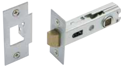
Rectangular face and universal strike features sintered steel cam 60mm backset, Heavy duty 980 CP PB* SC