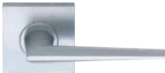
Aero lever on square backplate 9961 CP SC