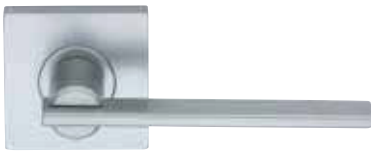
Linear lever on square backplate 9913 CP SC