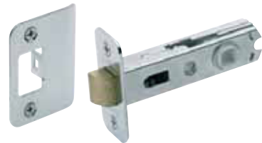
Radius corner face and strike 60mm backset 488 BC PB