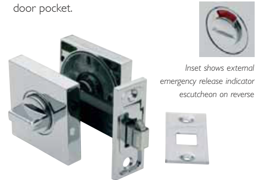
Sliding indicator bolt set 99SIB CP SC