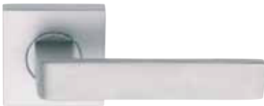
Senator lever on square backplate 9965 CP SC