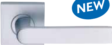
Congress lever on square backplate 9968 CP SC