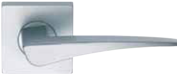
Curvelle lever on square backplate** 9962 CP SC