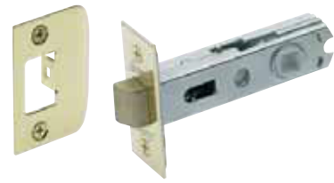
Rectangular face and strike 60mm backset 480 BC FB PB SC (481 70mm backset)