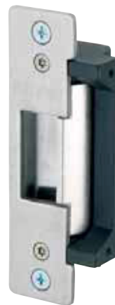
Electric strike ES1000/12 SS ES1000/12M SS (Monitored) ES1000/24 SS ES1000/24M SS (Monitored)

When ordering, add relevant finish code to form complete catalogue number, as shown under products illustrated.