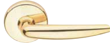
Form lever on smooth round rosette 9332 BG CP DB SC