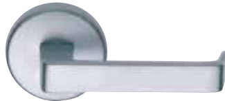
President lever on smooth round rosette 9350 CP SC