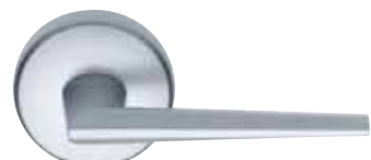
Aero lever on smooth round rosette 9361 CP SC