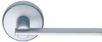
Linear lever on smooth round rosette 9313 CP SC