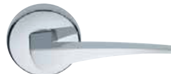
Curvelle lever on smooth round rosette** 9362L CP SC

When ordering, add relevant finish code to form complete catalogue number, as shown under products illustrated.