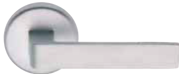
Senator lever on smooth round rosette 9365 CP SC