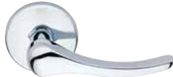
Dias lever on smooth round rosette** 9331L BG CP DB SC