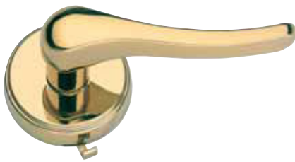
Privacy adaptor with Dias leverset 9009 BG CP DB SC