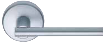
Horizon lever on smooth round rosette 9348 CP SC