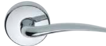
Zephyr lever on smooth round rosette** 9360L CP SC