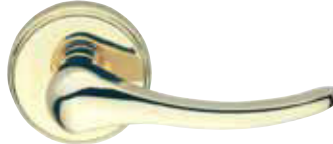
Dias lever on stepped round rosette** 9131L BG CP DB SC