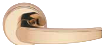
Outline lever on stepped round rosette 9189 BGS CPS DBS SCS