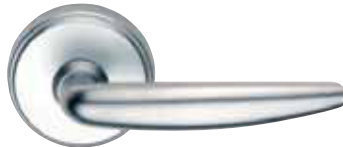
Form lever on stepped round rosette 9132 BG CP DB SC