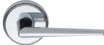
Aero lever on stepped round rosette 9161 CP SC