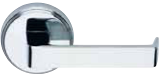
President lever on stepped round rosette 9150 CP SC