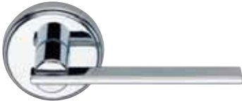
Linear lever on stepped round rosette 9113 CP SC