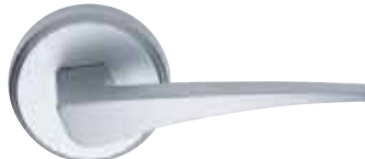
Curvelle lever on stepped round rosette** 9162L CP SC