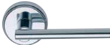
Horizon lever on stepped round rosette 9148 CP SC