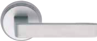
Senator lever on stepped round rosette 9165 CP SC