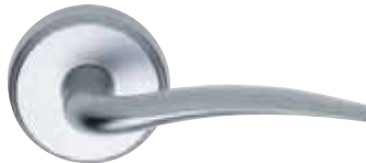
Zephyr lever on stepped round rosette** 9160L CP SC