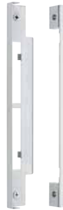
777 RK Rebate Kit to suit 775 Series Roller Bolt Mortice Lock 777 RK SC