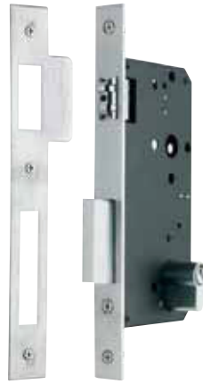
775 Roller Bolt Mortice Lock Double Cylinder 60mm backset 775 SC 60 775 SC 45

Features non-handed design for left or right-handed doors.