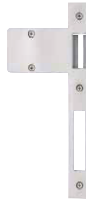
Extended Strike Plate to suit 775 Series Mortice Lock Right-handed. (Suits right-hand opening in: left-hand opening out) PT775/SPEIR SSS