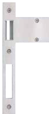
Extended Strike Plate to suit 775 Series Mortice Lock Left-handed. (Suits left-hand opening in: right-hand opening out) PT775/SPEIL SSS