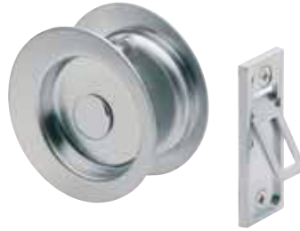
396 Circular Sliding Cavity Set – Passage BC CN PB SC

Note: 396 FP Faceplate is also available as a separate item in all four finishes