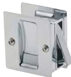
394 Rectangular Sliding Cavity Set – Passage AB AC BC CN PB SC