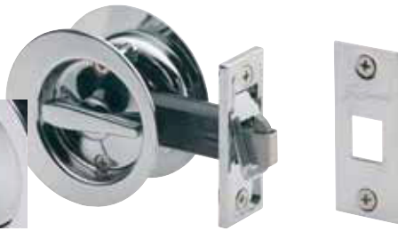
395 Circular Sliding Cavity Door Lock – Privacy BC CN PB SC (Inset above shows exterior emergency release)