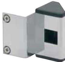
398 Box Staple BC CN PB SC